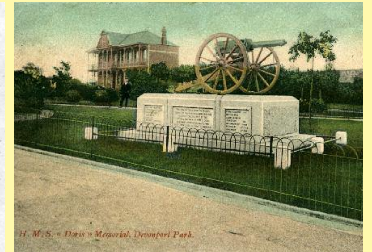
HMS Doris Gun and Higher Lodge, c.1905 Plymouth City Museum & Art Gallery