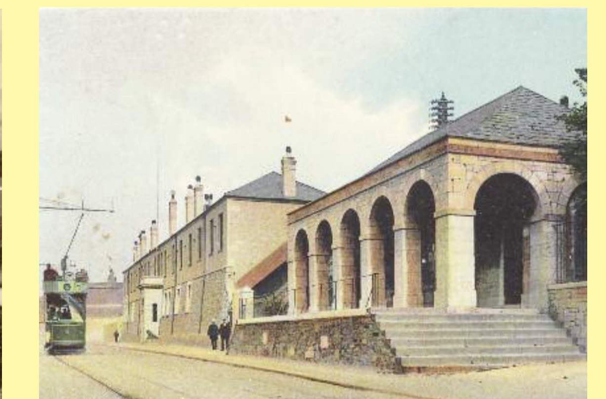
Guard House and Cumberland Block, Devonport Hill, c.1905