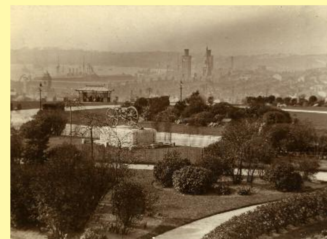
Park and view to the north-west, c.1905

To complete the Trail, follow the old military road, now Raglan Road and Madden Road, past the Gatehouse to Raglan Barracks, built in the 1850s. On descending Devonport Hill - the Napoleonic Guardhouse of 1811, the drawbridge cutting and Bluff Battery, built 1779-80 to guard Stonehouse Bridge, are further reminders of Devonport's historic defences.